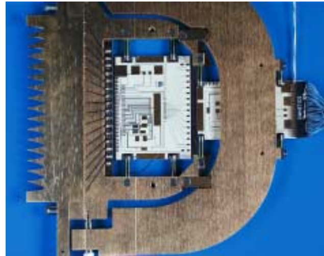
Close-up view of one of the detector modules for the PACS 16x25 pixel array of highly stressed Ge:Ga detectors.