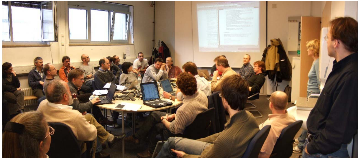
Fig.2: Every day, at around 14:00, when Shift 1 hands over to Shift 2, we have a briefing. As you can see, the PACS operations room ("opera" for short) is really getting crowded these days.