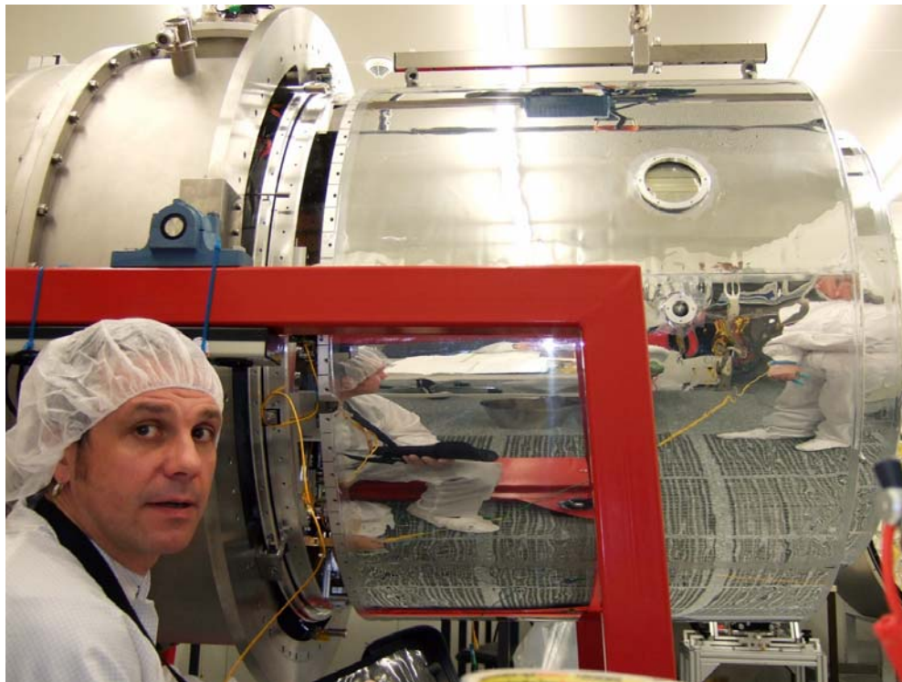
Fig. 2: PACS in the Cryostat, shortly before closing

News from DECMEC: CRISA might have identified the problem. A test board is working now. The solution has to be implemented on the FM boards, and vibrational, thermal, and functional tests will be done at CSL. This will take several weeks, which is the reason for the decision to cool down now and start the ILT with the EQM version.